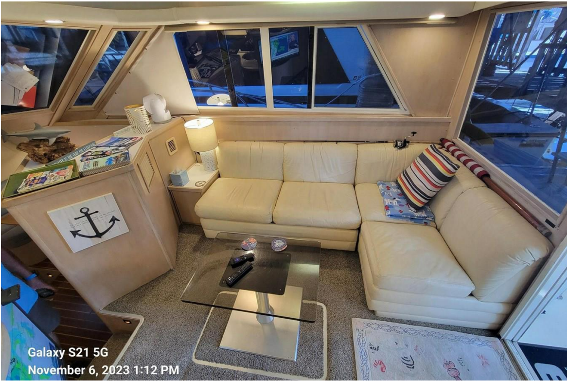
Galaxy S21 5G November 6, 2023 1:12 PM