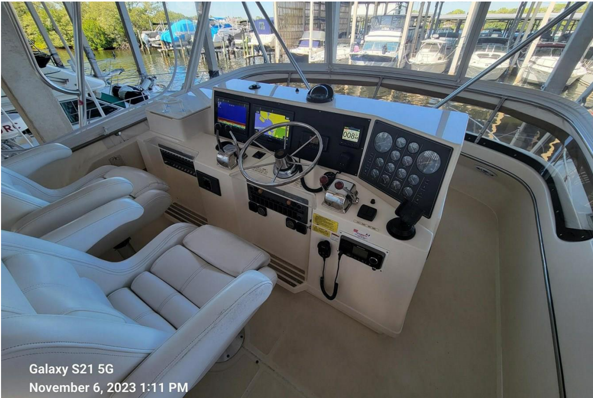
Galaxy S21 5G November 6, 2023 1:11 PM