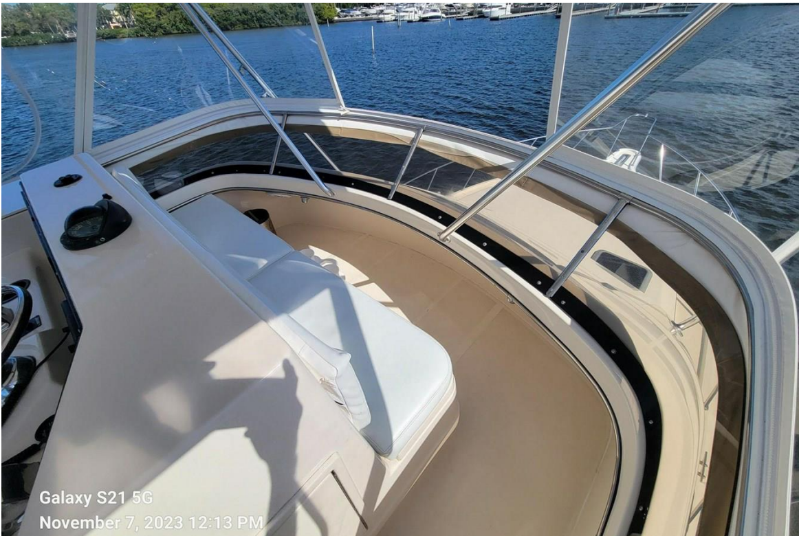
Galaxy S21 5G November 7, 2023 12:13 PM