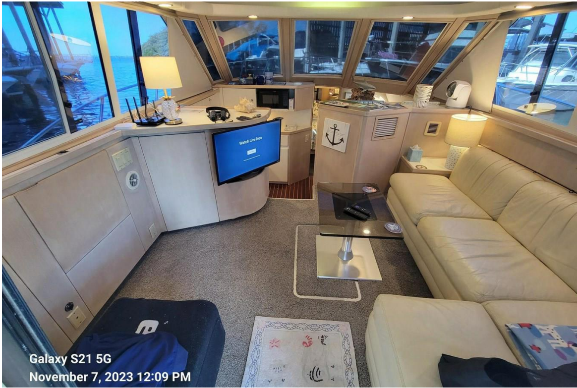
Galaxy S21 5G November 7, 2023 12:09 PM