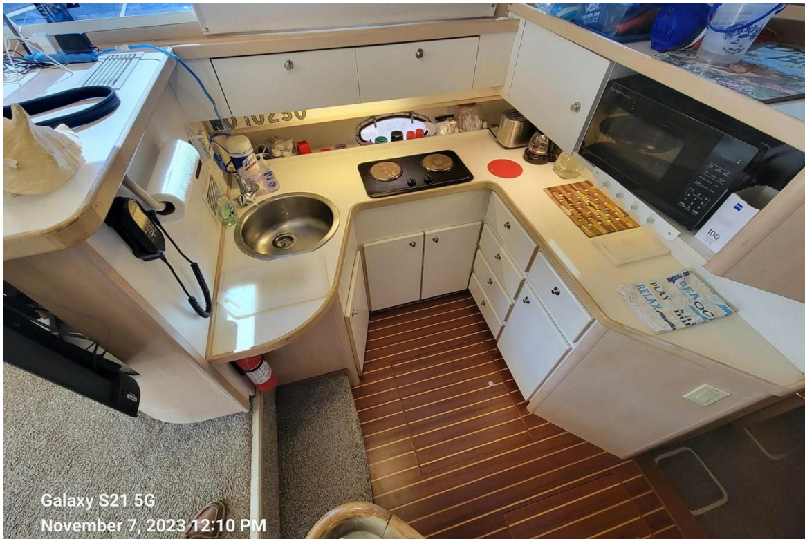
Galaxy S21 5G November 7, 2023 12:10 PM