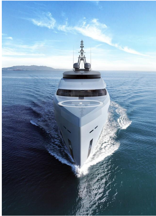
81 Vetruvius - bow