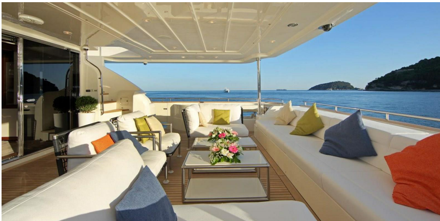
Exterior Lady Dia