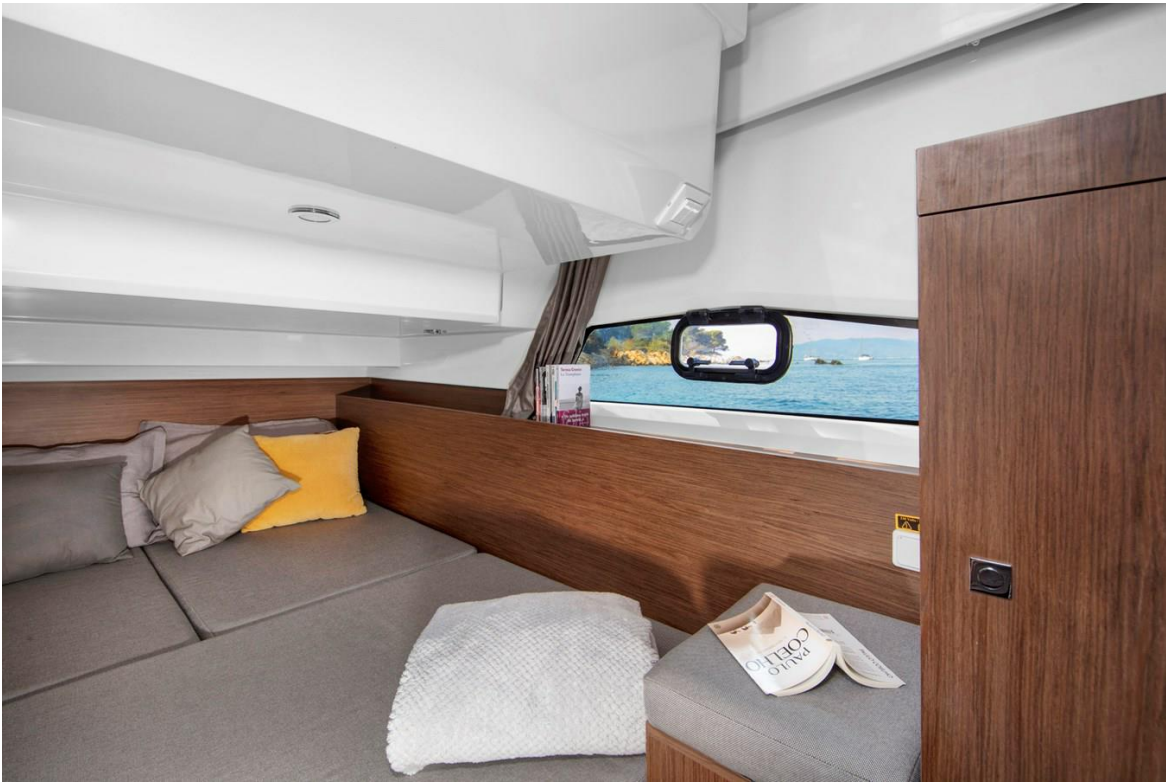
Image 9_3rd Cabin