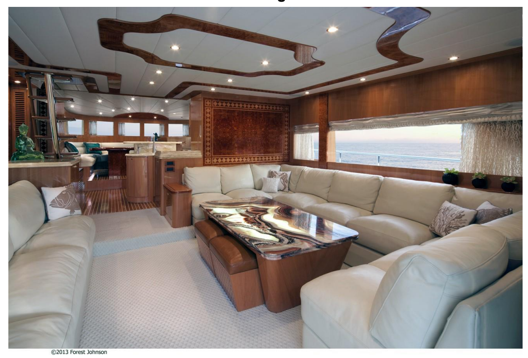
Forward Dining Area