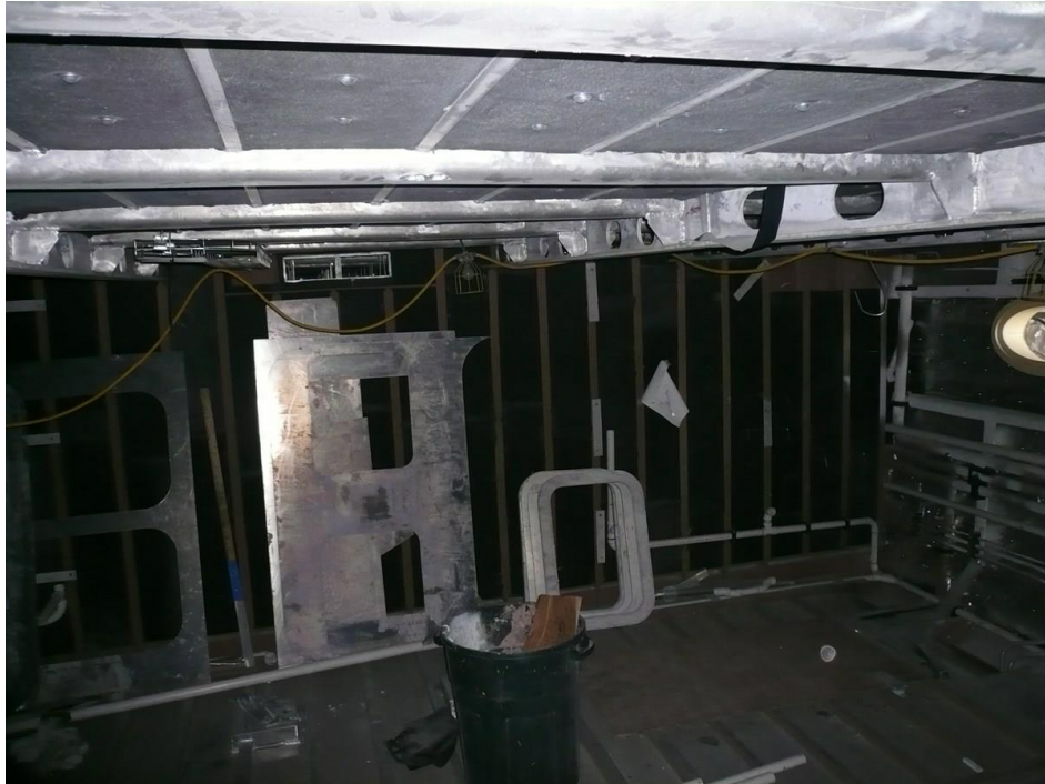
T-056 rendering -3