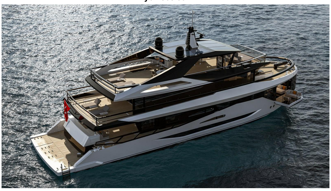
Dyonisos 35 5