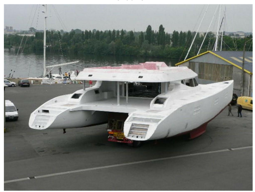
Turning of Hulls