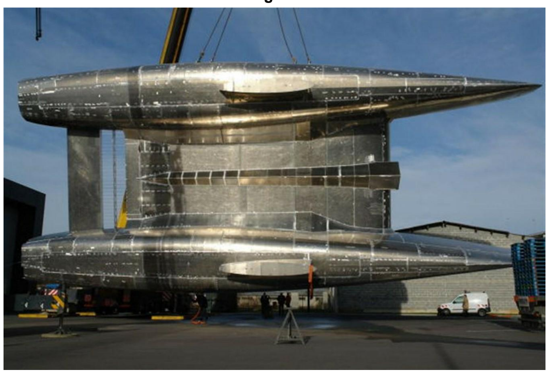
Single Deck Layout