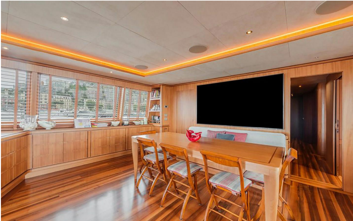
16542.7 Master Cabin