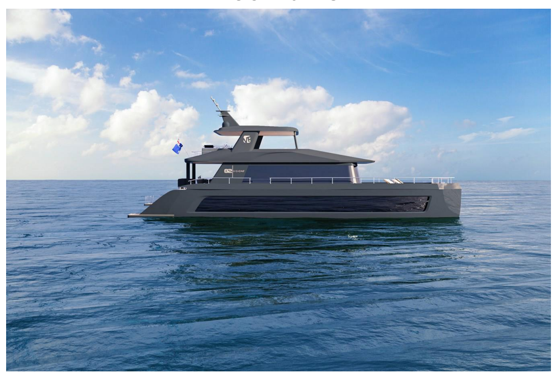
VISION F 82ALU