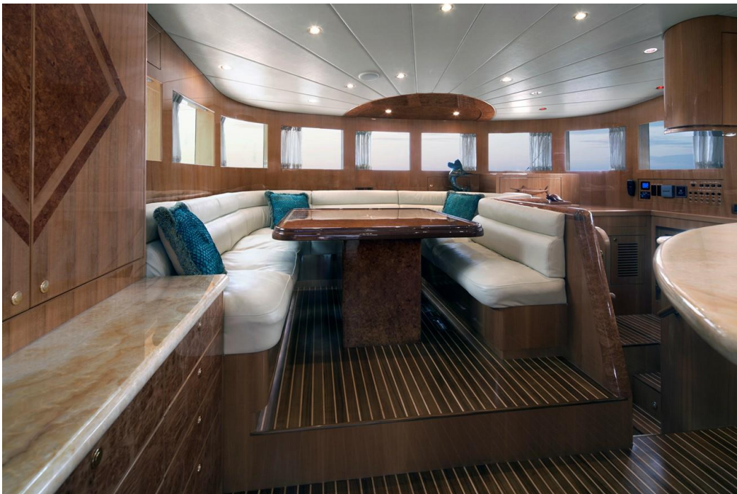
Forward dining area