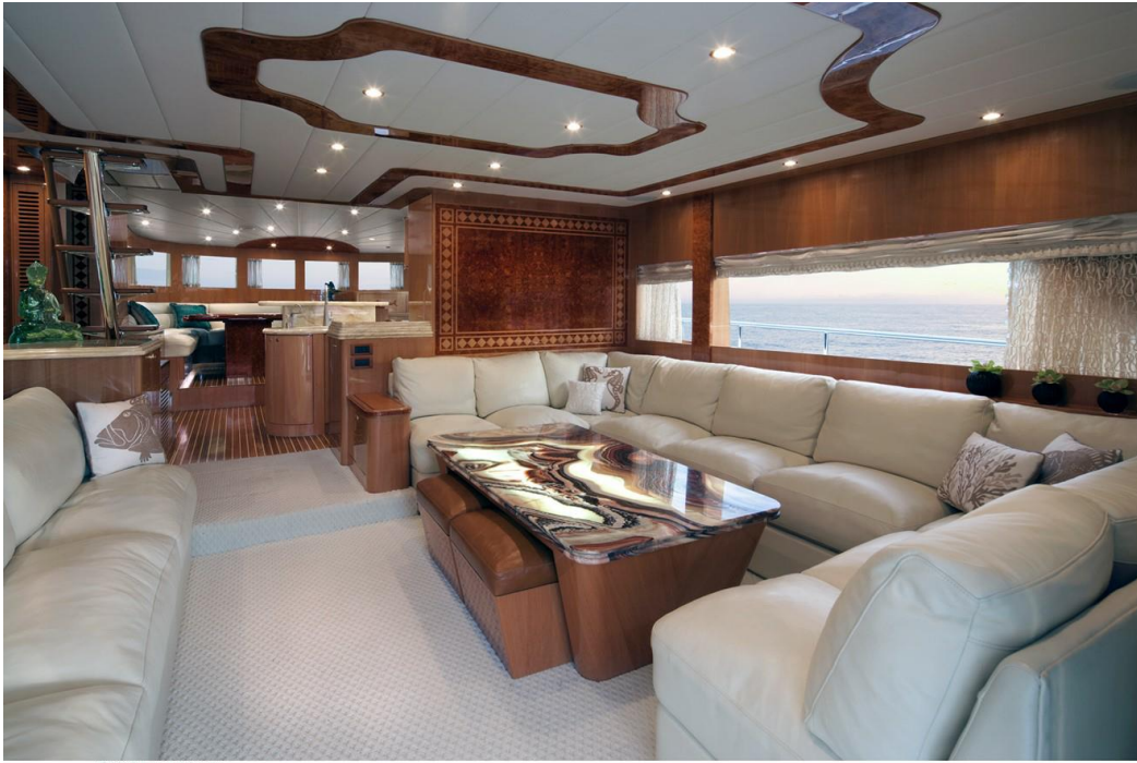
Salon looking forward