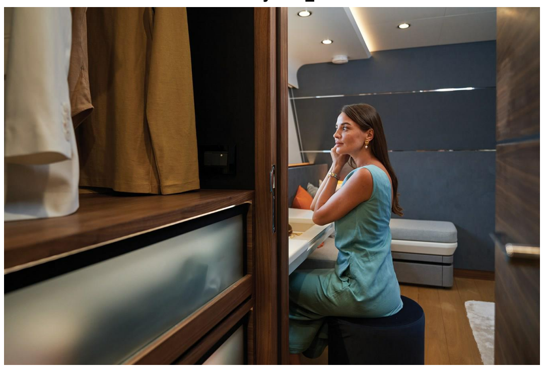
CLB88 Lifestyle 10_DIGITAL