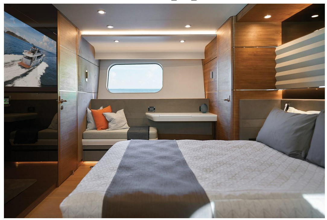
CLB88 Interior 15_FWD VIP HEAD_DIGITAL