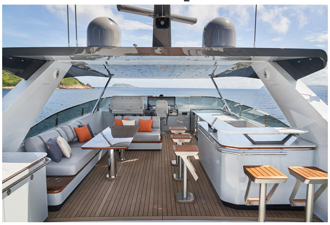
CLB88 Exterior 14_DIGITAL