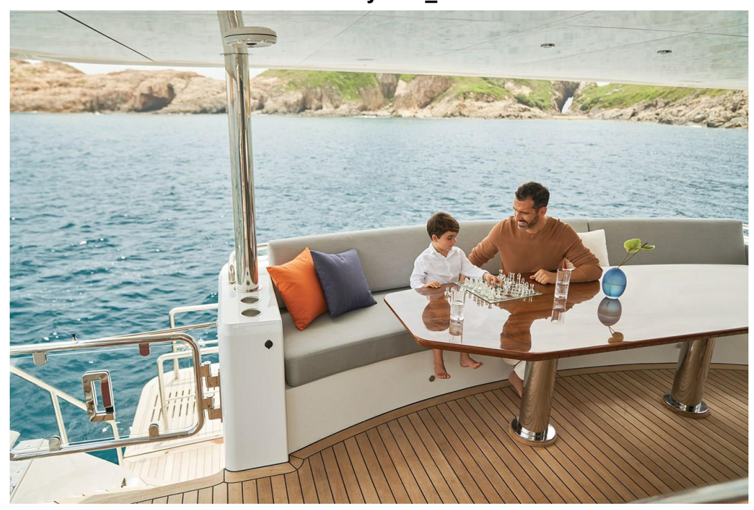
CLB88 Lifestyle 01_DIGITAL