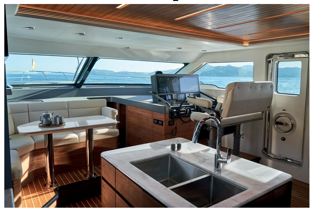
CLB88 Interior 11_DIGITAL