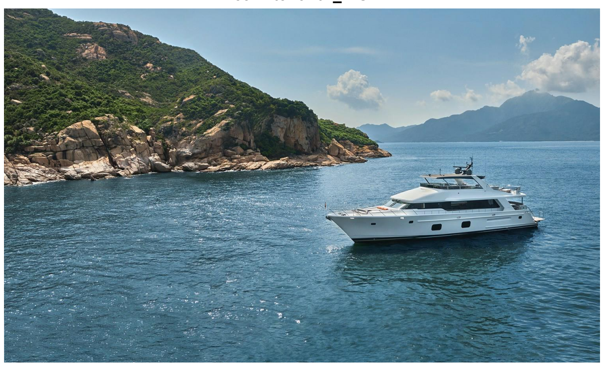
CLB88 Exterior 06_DIGITAL