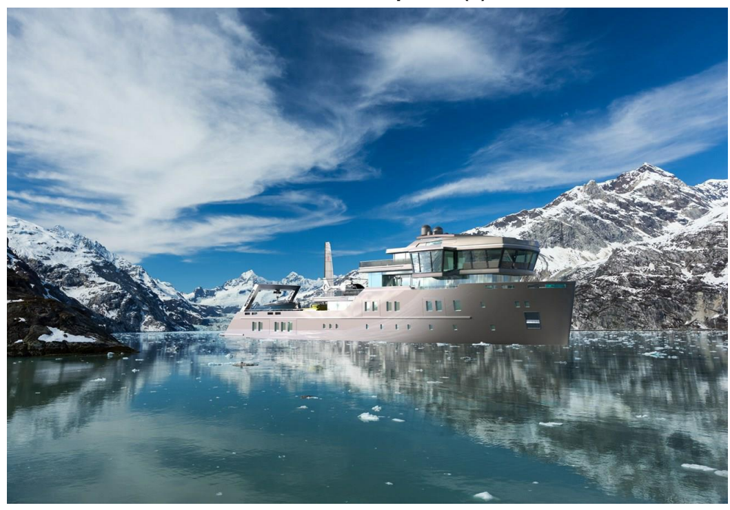
Doerries 70 Explorer (2)