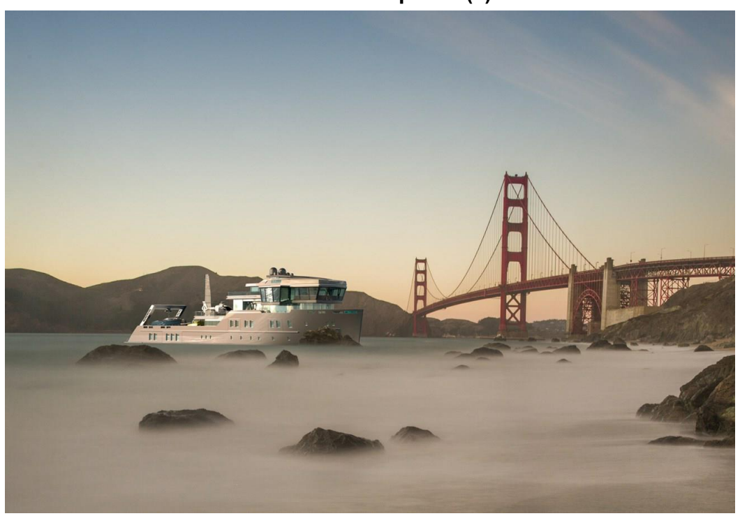
Doerries 70 Explorer (7)