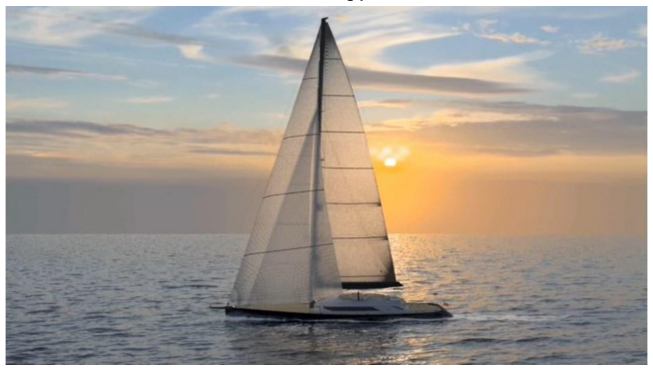
50M Running SBS