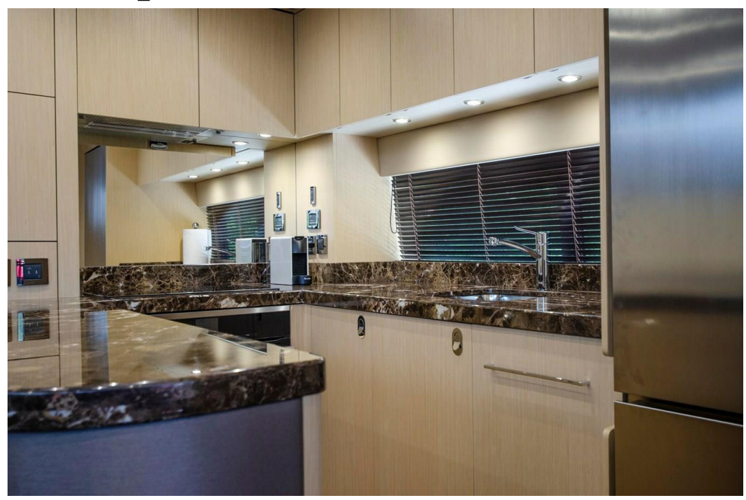
15_2018 75ft Sunseeker Yacht SECOND THOUGHTS