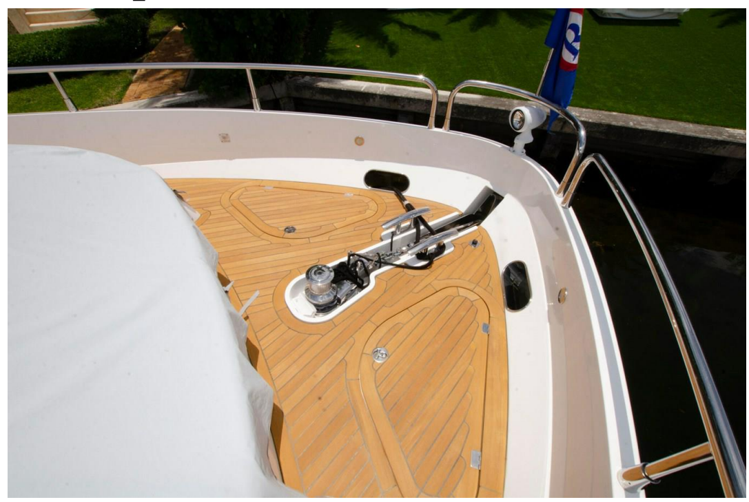
5_2018 75ft Sunseeker Yacht SECOND THOUGHTS