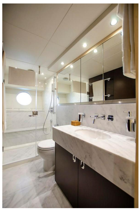
21_2018 75ft Sunseeker Yacht SECOND THOUGHTS