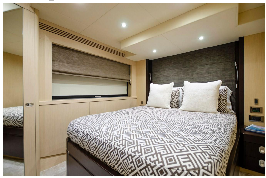
23_2018 75ft Sunseeker Yacht SECOND THOUGHTS