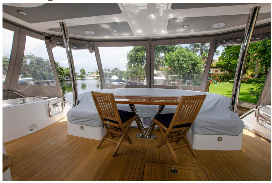
9_2018 75ft Sunseeker Yacht SECOND THOUGHTS