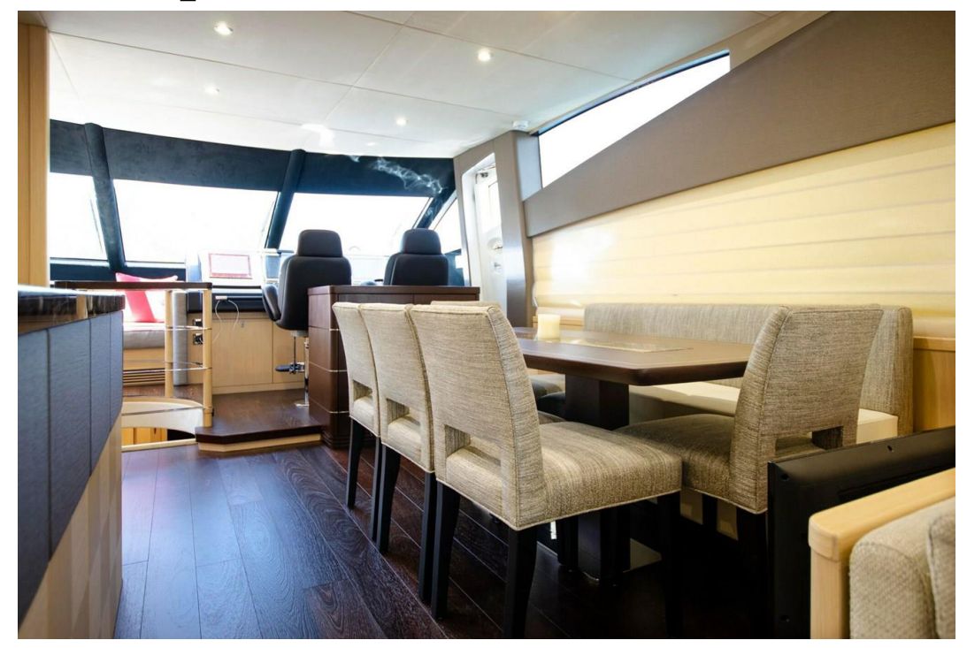
13_2018 75ft Sunseeker Yacht SECOND THOUGHTS