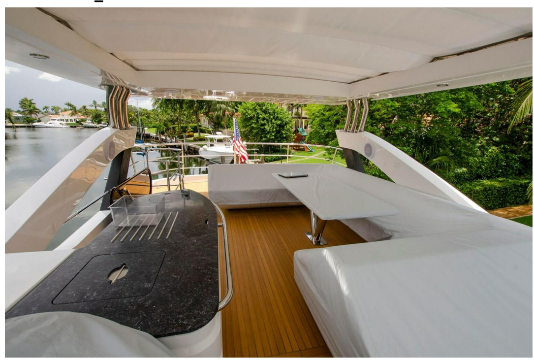
7_2018 75ft Sunseeker Yacht SECOND THOUGHTS