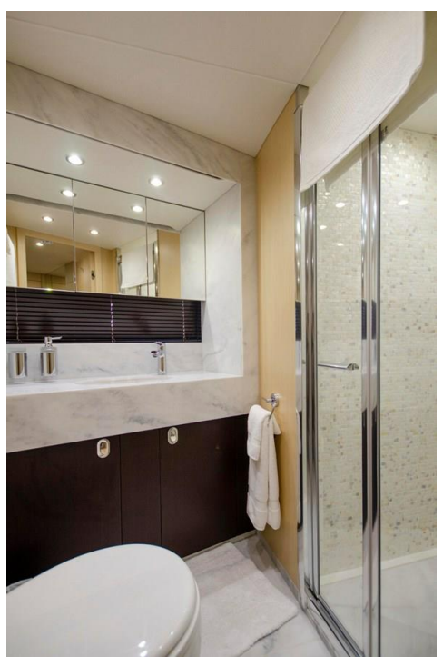
25_2018 75ft Sunseeker Yacht SECOND THOUGHTS