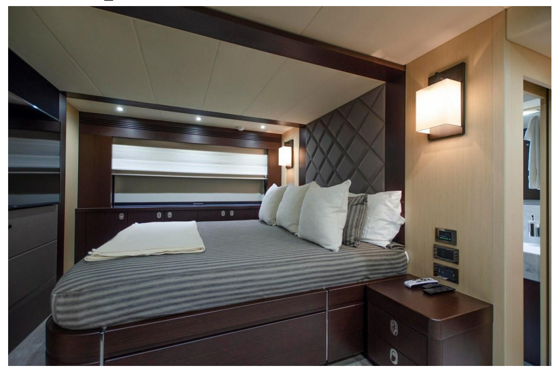
19_2018 75ft Sunseeker Yacht SECOND THOUGHTS