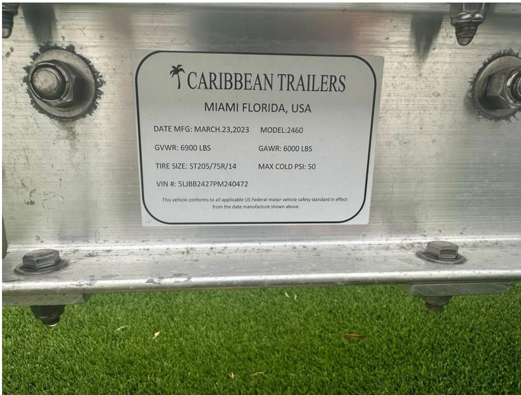
WhatsApp Image 2024-12-13 at 09.19.57 (4)