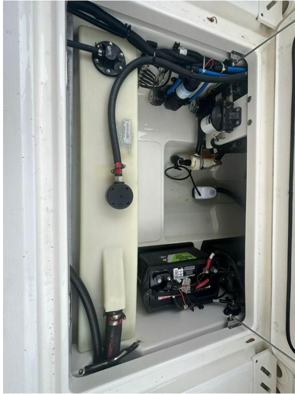
WhatsApp Image 2024-12-13 at 09.19.57 (2)