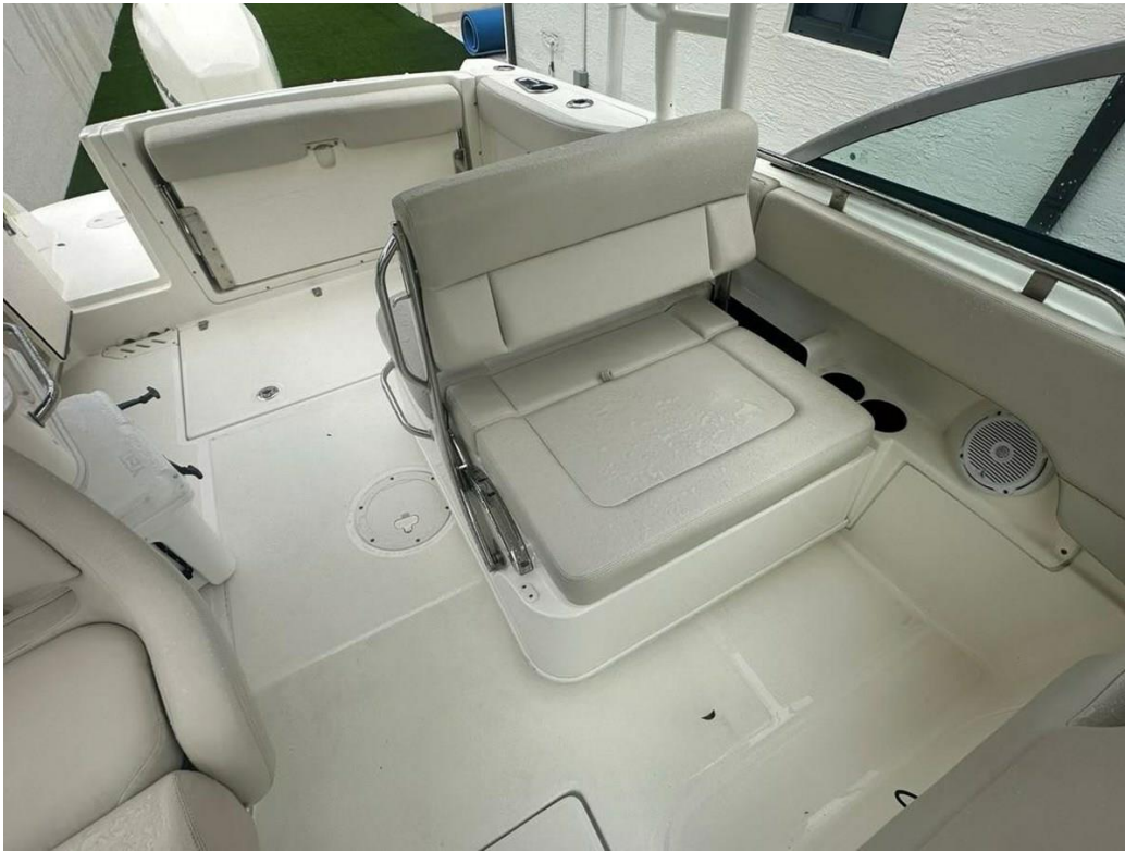
WhatsApp Image 2024-12-13 at 09.19.57 (15)