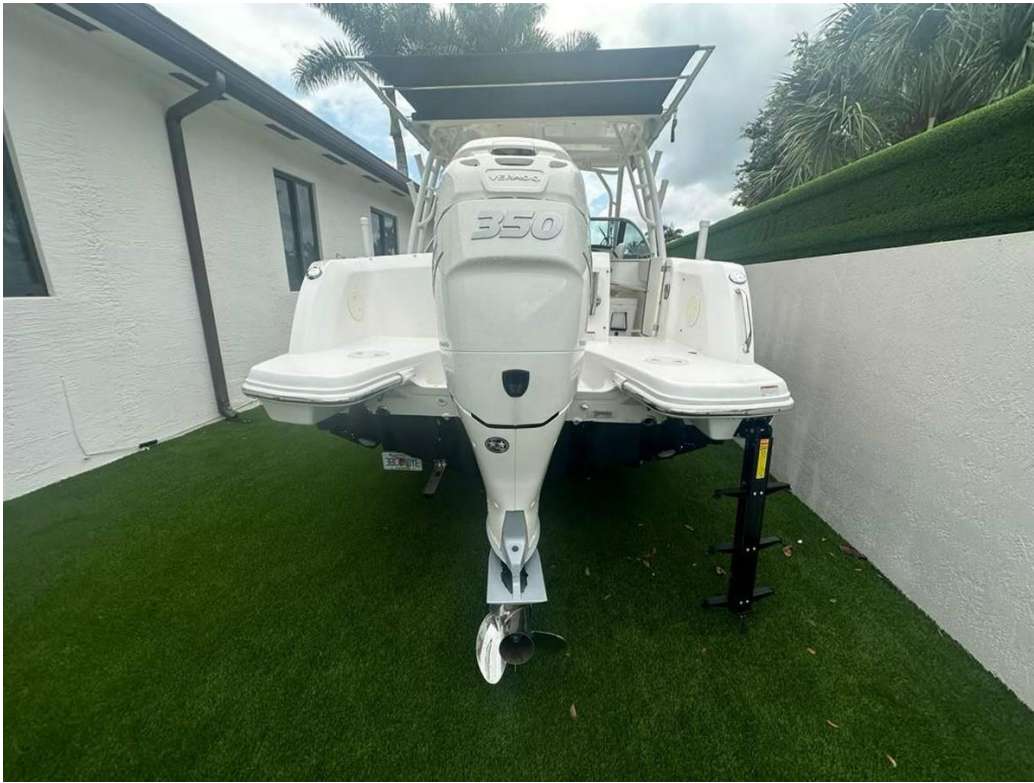
WhatsApp Image 2024-12-13 at 09.19.57 (9)