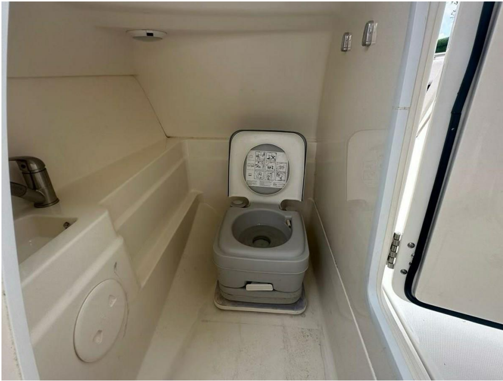
WhatsApp Image 2024-12-13 at 09.19.57 (17)