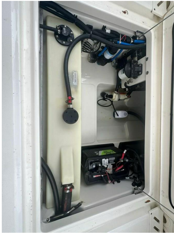
WhatsApp Image 2024-12-13 at 09.19.57 (2)