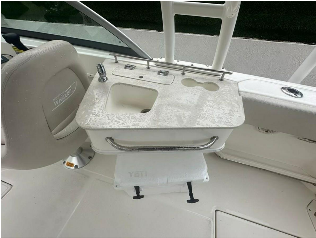
WhatsApp Image 2024-12-13 at 09.19.56