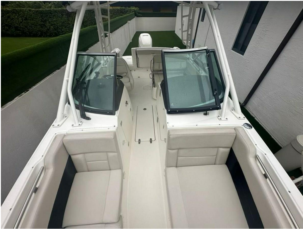
WhatsApp Image 2024-12-13 at 09.19.57 (19)