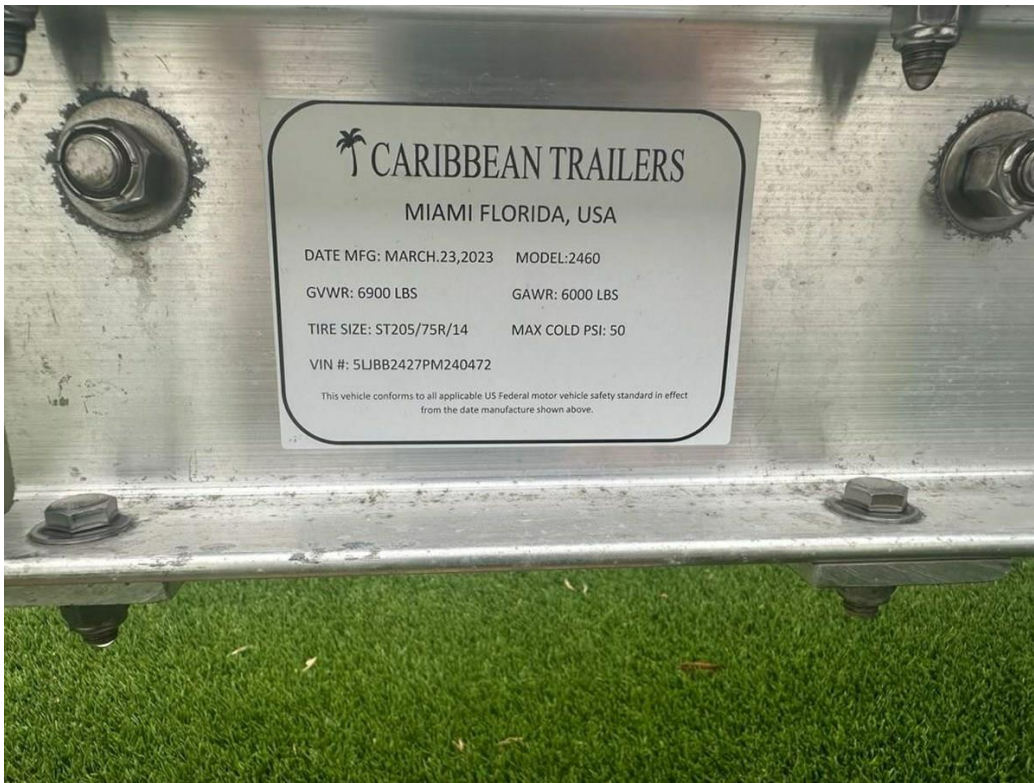
WhatsApp Image 2024-12-13 at 09.19.57 (4)