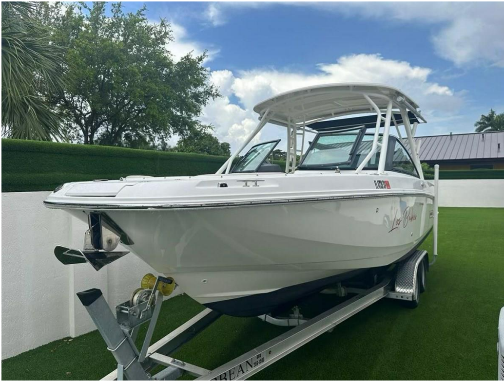
WhatsApp Image 2024-12-13 at 09.19.57 (6)