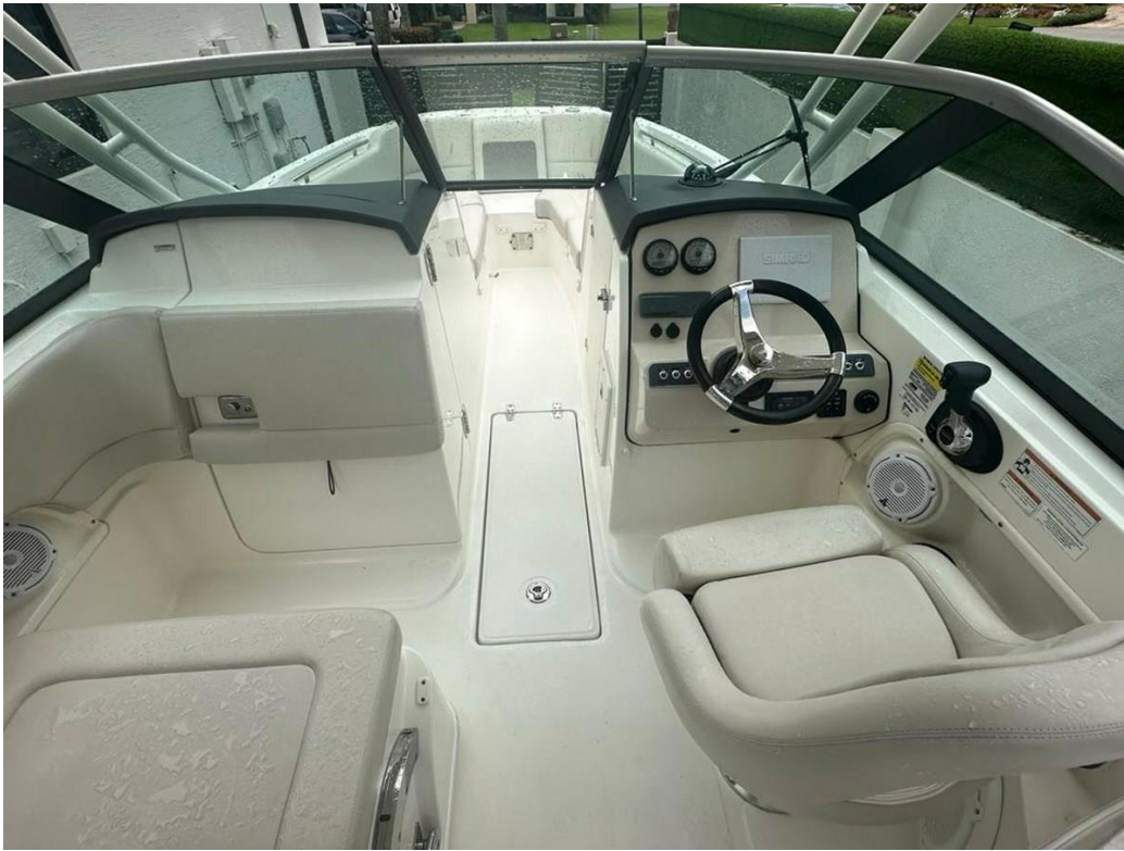
WhatsApp Image 2024-12-13 at 09.19.57 (13)