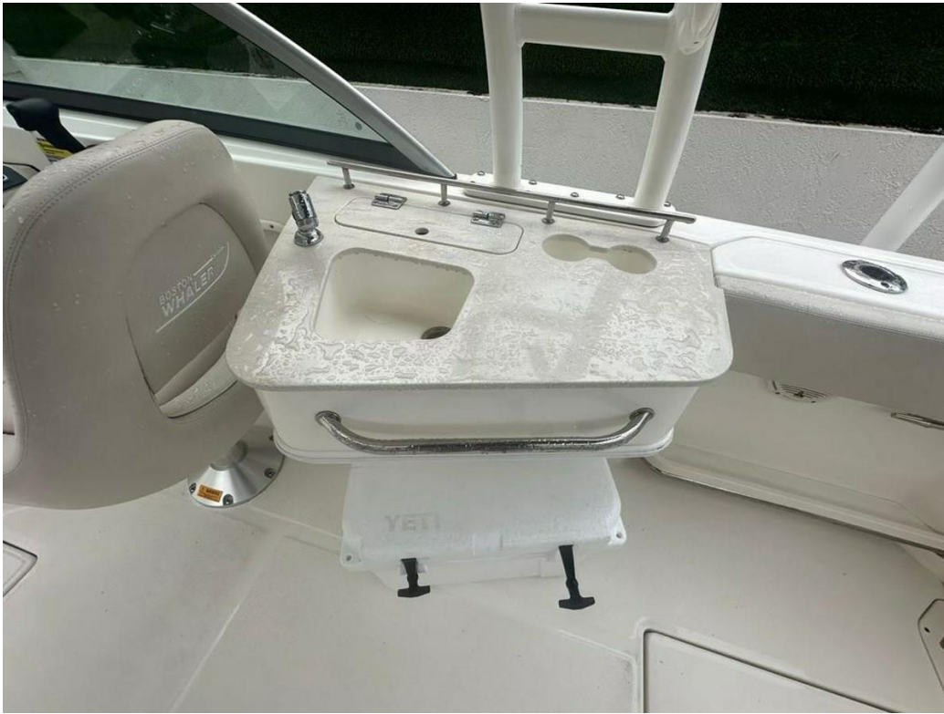
WhatsApp Image 2024-12-13 at 09.19.56