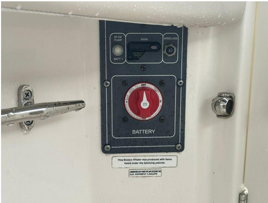
WhatsApp Image 2024-12-13 at 09.19.56 (2)