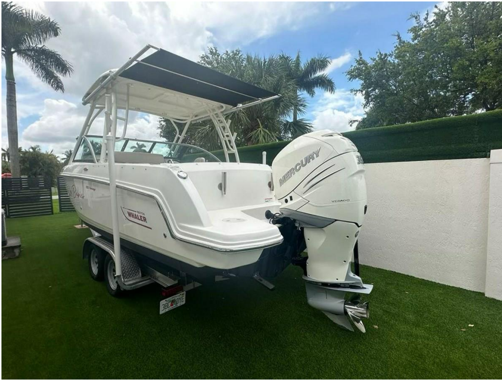
WhatsApp Image 2024-12-13 at 09.19.57 (11)