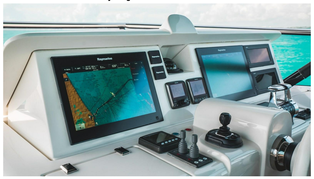
Large Spacious Flybridge