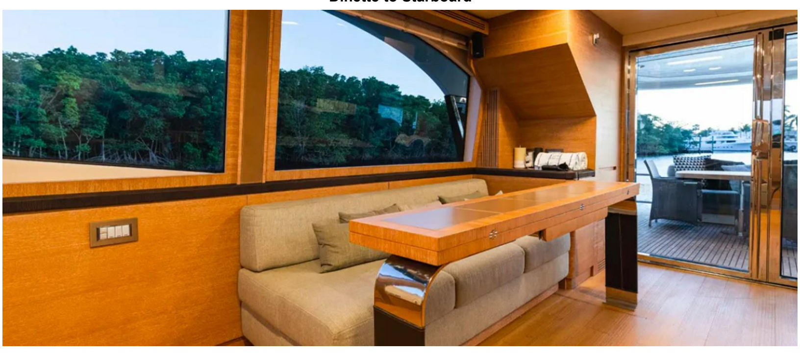
Dinette and Galley